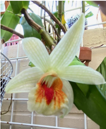
Dend. Green Lantern 'Red Carpet' Geanna Gravois