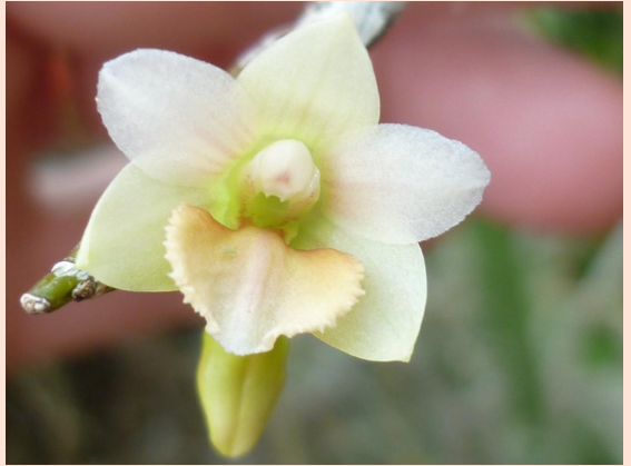
Dendrobium Booseii Nancy Anne Rowe