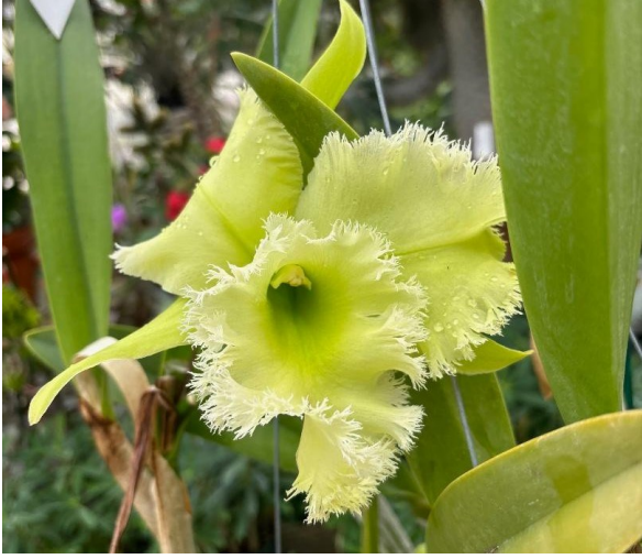
Blc. Golf Green 'Hair Pig' -Eddie Dupuy